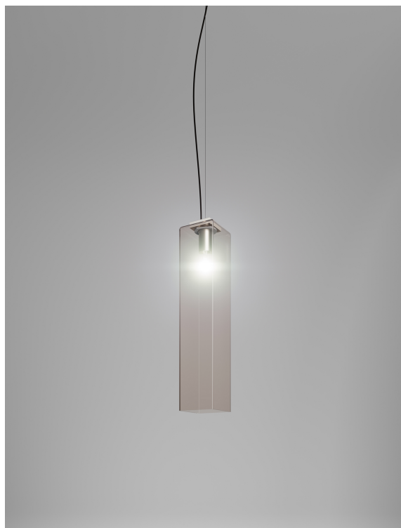
TUBES SP 60 FUTR NO E27 CE