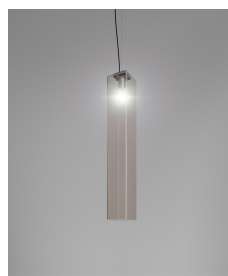
TUBES SP 90